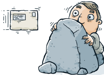
Do You Ever Wish Those Darn Bills Would Just Go Away?

Do you ever wish those darn bills would just go away? Are you frustrated with how long it's taking to pay off your debts? Do you wish you had less financial stress in your life? If so, you're not alone. But don't despair, there is a way out.